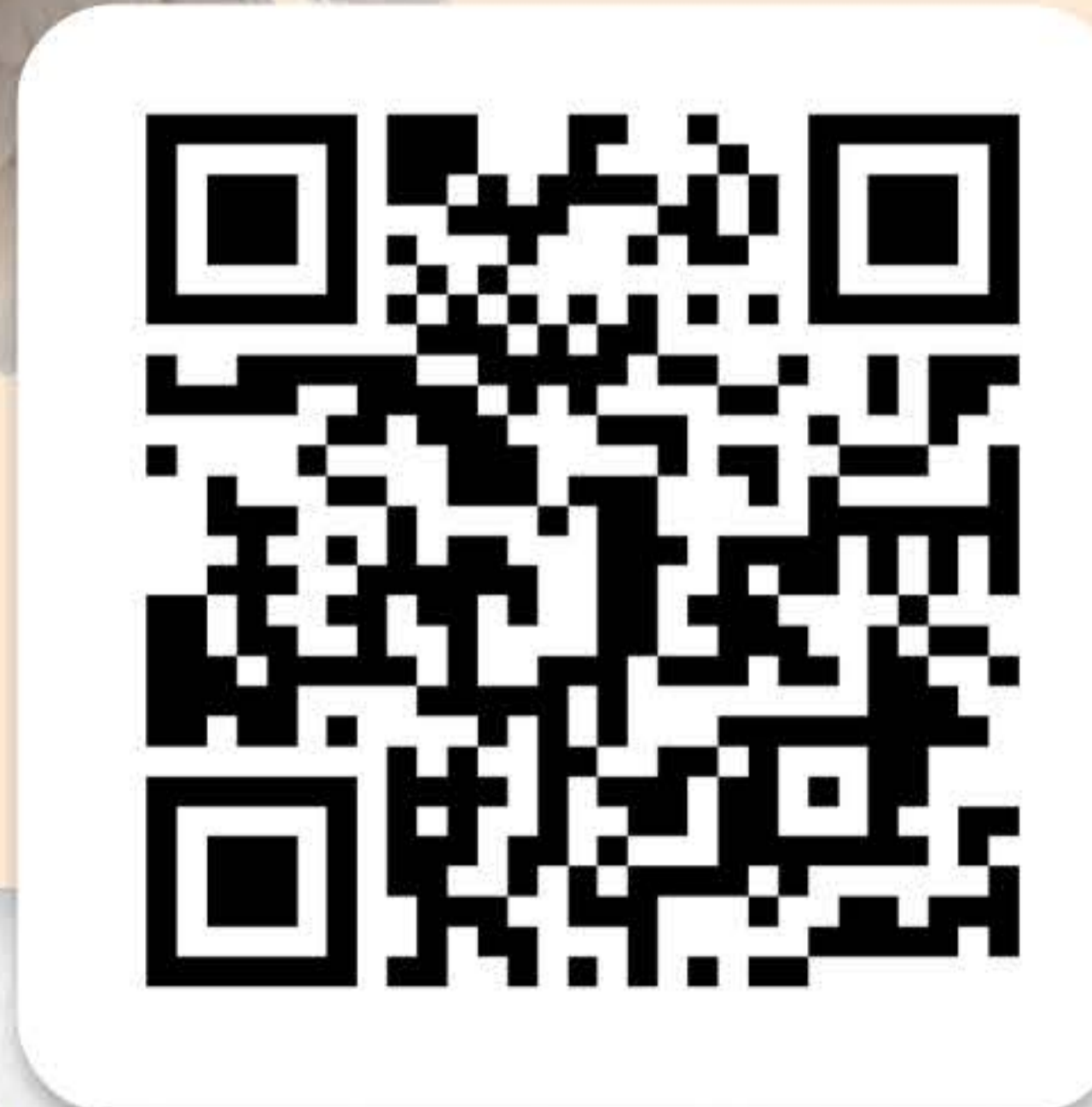
How to get there with Maps?